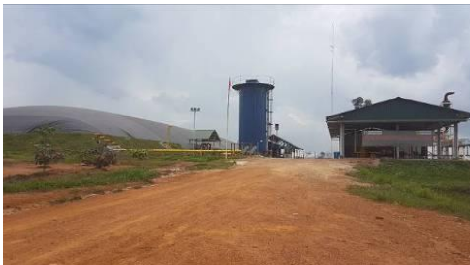
Biogas Plant at Tengkalat Mill

Also, the company has procedure for GHG emission inventory “SOP Inventarisasi dan Mitigasi Emisi GRK (No. Dok: GPL/SOP/Umm-28, Rev. 00; 2 Maret 2016)”. Tengkalat POM has installed Biogas Plant and integrated with Palm Oil Mill since March 2016. This effort as a company commitment to reduce of GHG emission and producing renewable energy.