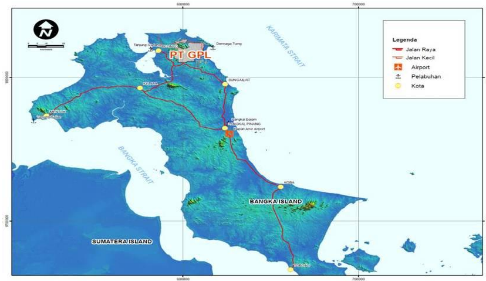
Figure 1. Location Map of PT GUNUNG PELAWAN LESTARI