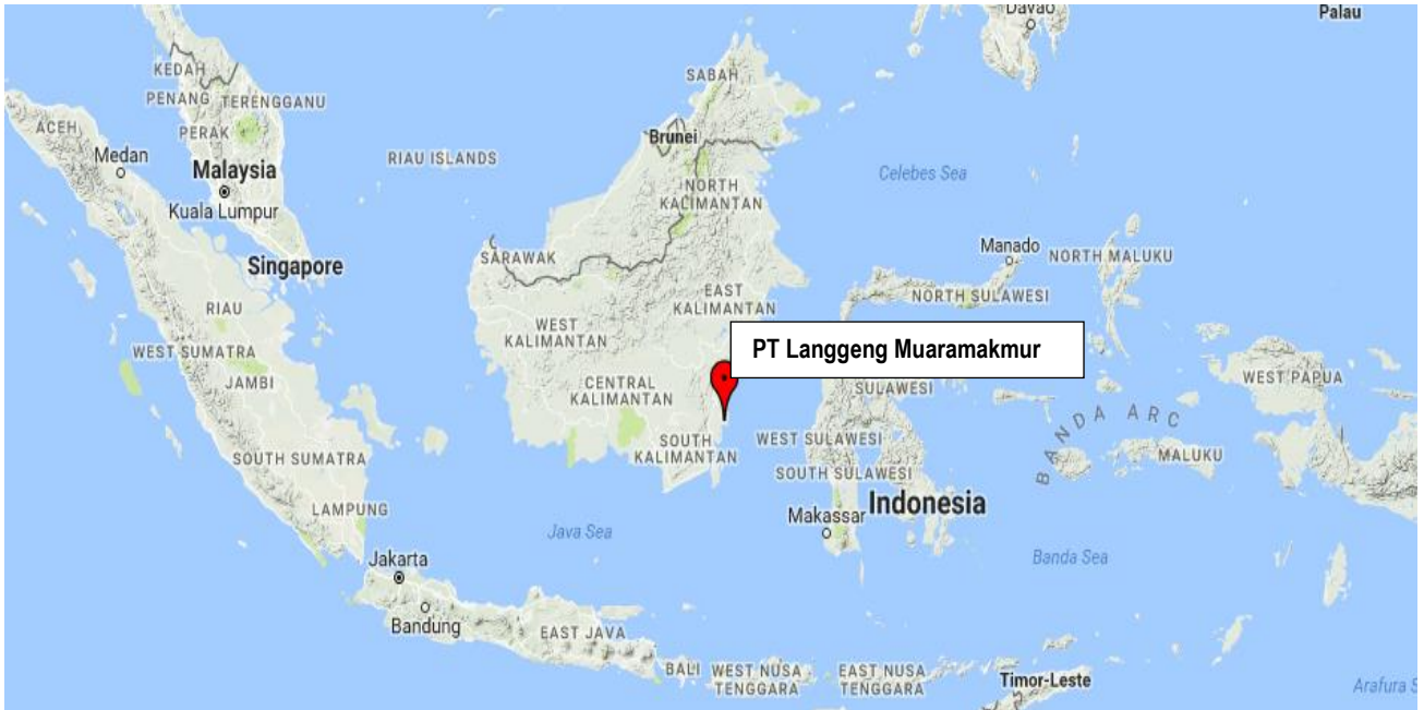
Figure 1. Location Map of PT Langgeng Muaramakmur