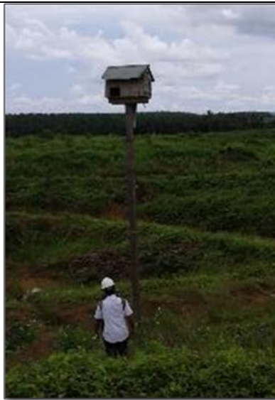
Barn owl Box in Rantau Estate