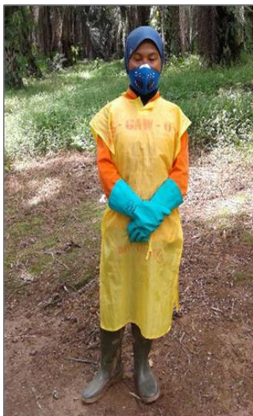
PPE of Pesticide Applicator of PT LMI in accordance with MSDS requirement (NIOSH approved)

Spraying foreman interviewed at Matalok Estate, Sangkoh Estate, and KKPA-ASC admitted to check PPE every day during the morning attendance. Any inappropriate PPE will then be replaced. The company can show document of PPE delivery to workers. For example, at Sangkoh Estate, on 17 th May 2017 was handed over 15 sets of spray uniforms and on 1 st August 2017 handed over 15 pieces of masks to spray workers.