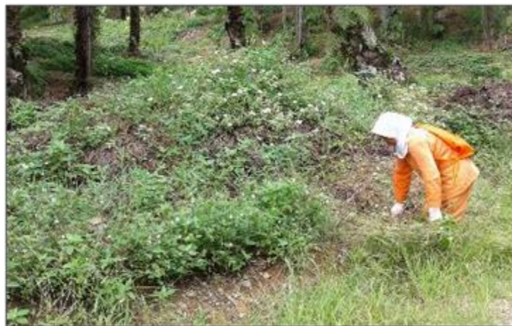
Manual Upkeep of Beneficial Plant in Matalok Estate

The spraying workers interviewd at Lanting Estate, Matalok Estate, Sangkoh Estate, and KKPA-ASC claimed that the company does not use pesticides prophylactically.