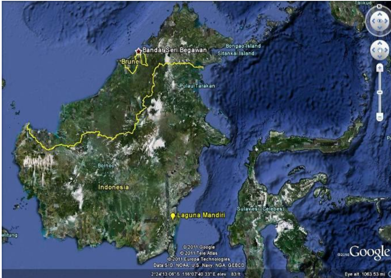
Figure 1. Location Map of Rantau POM – PT Laguna Mandiri