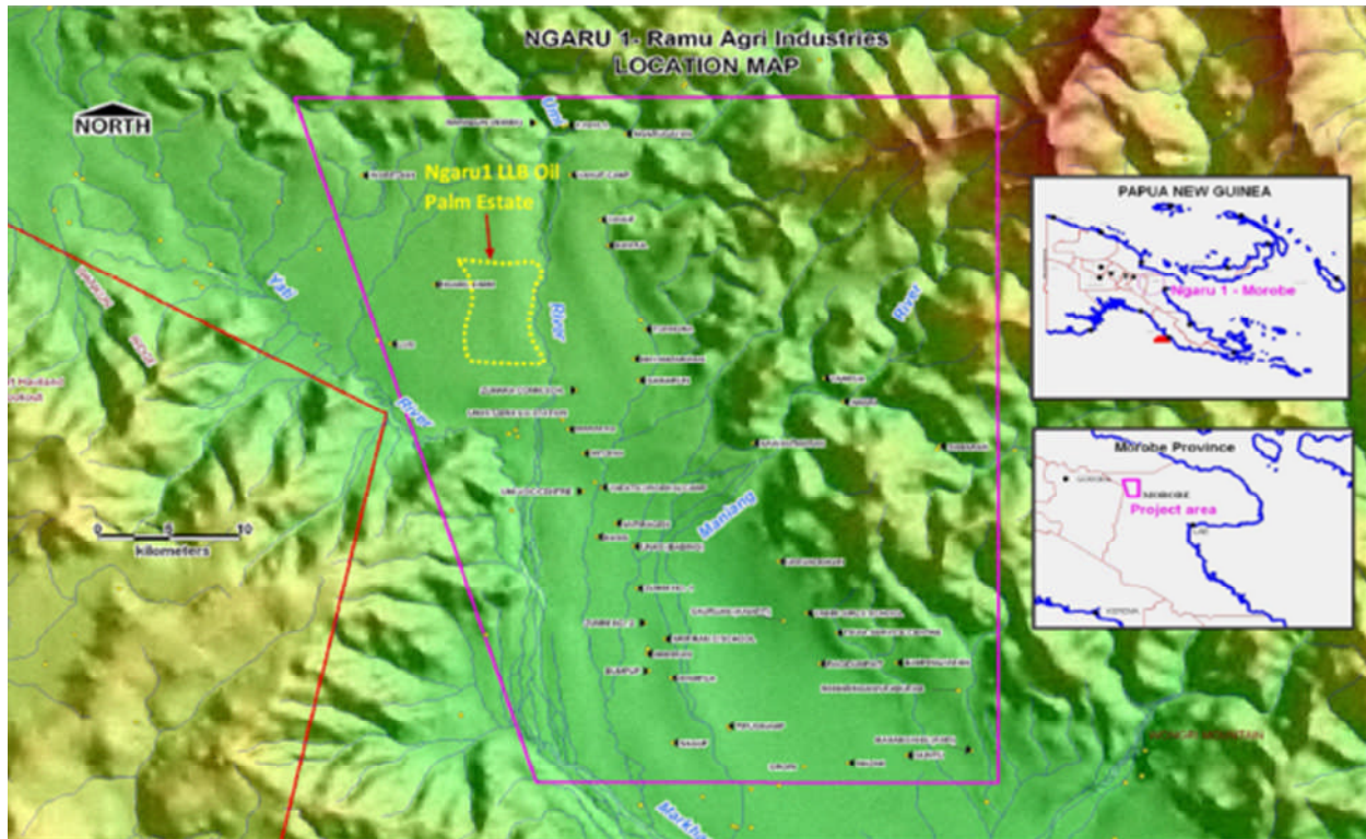
Map 2 Location of proposed new planting: description or maps and GPS coordinates.