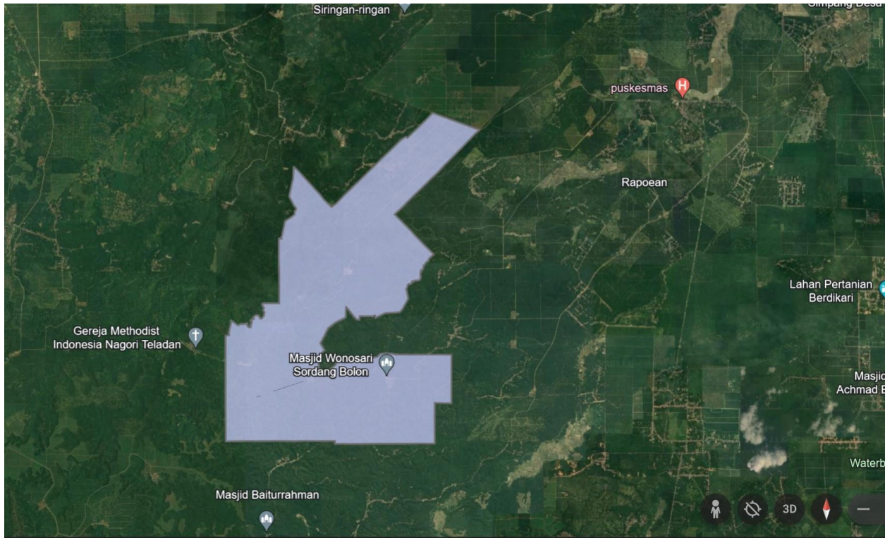
Location of Kebun Padang Matinggi