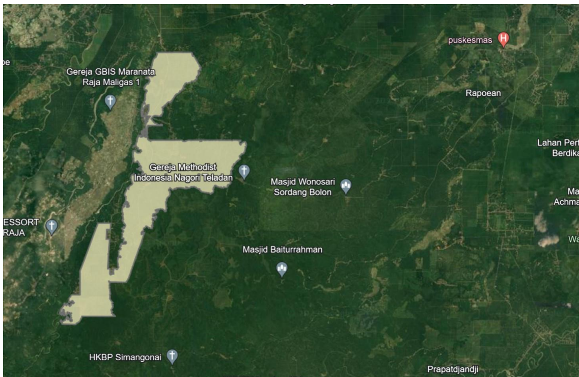
Location of Mayang