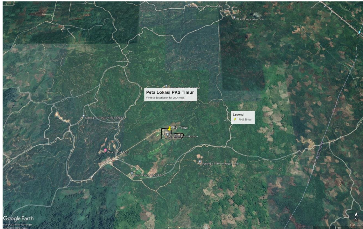
Map of PKS Timur Location