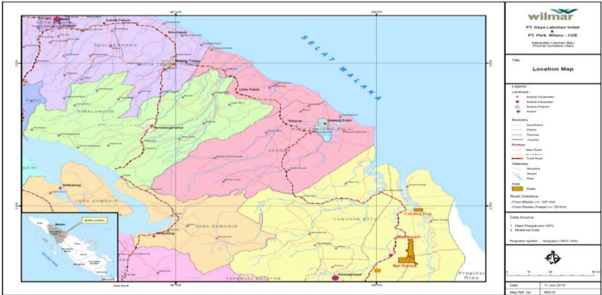
Figure 1. Location Map of Daya Labuhan Indah 2 and Perkebunan Milano.