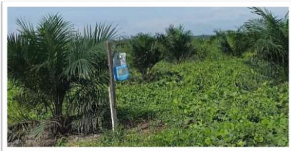
Figure 1 LCC in immature area

Based on field observation, the company has implemented some treatment to maintain soil fertility. For example, planting LCC in immature area as land cover and help steam root to fixation nitrogen from the air, reducing evaporation and reducing weeding growth.