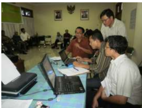
Participants creating the training module