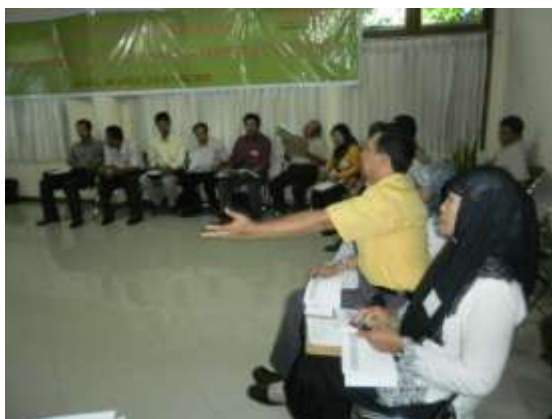
A participant giving his views in the training session

With the dedication by the participants, facilitators, trainers and training committee, the example training modules and syllabus for the RSPO P&C for scheme smallholders were completed within the 10-day course. However, their job was not finished, the bigger challenge being to move forward and put the modules and syllabus into practice.