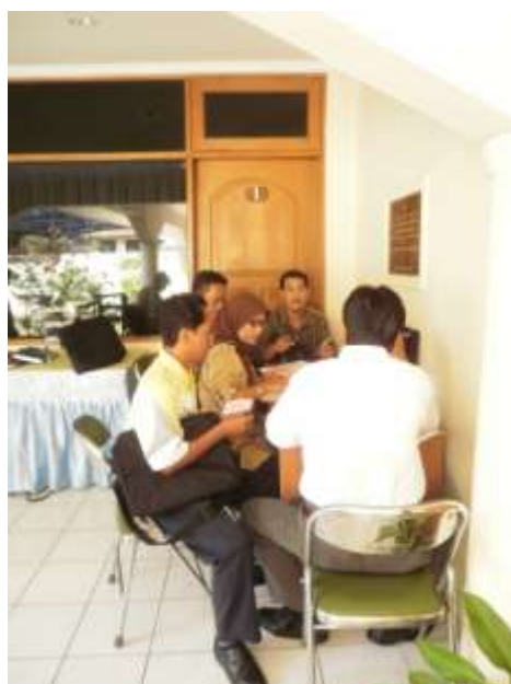
Small group discussions

“With the dedication by the participants, facilitators, trainers and training committee, the example training modules and syllabus for the RSPO P&C for scheme smallholders were completed within the 10-day course”