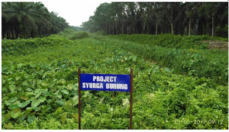
Figure 2: Water courses protected by buffer zone