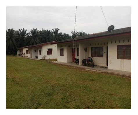
Workers Housing Quarters

Several new staff quarters and modern employees' house were built during 2016 in line with the UP Goal to provide its employees with the best housing facilities within the plantation industries. Upgrading the UP guest workers living quarters with the two apartment blocks completed 2011. Living facilities with a living area 220m2 per unit encompassing 3 bedrooms, 1 kitchen, 2 bathrooms and large hall and patio. More than 20 additional terrace apartment blocks have been built providing first class housing facilities for more than 140 employees