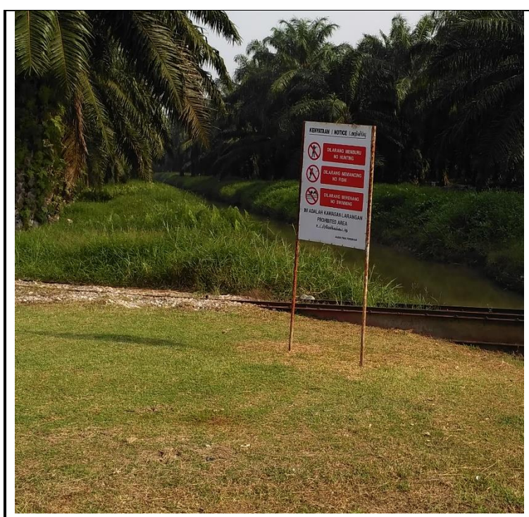
Figure 1: Water canal protection by signboard