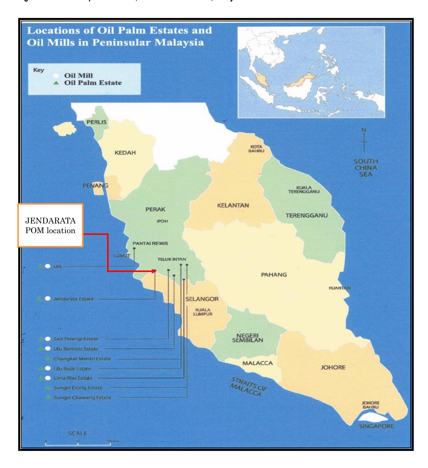
Figure 1. Location Map of Jendarata, United Plantation Bhd, Malaysia