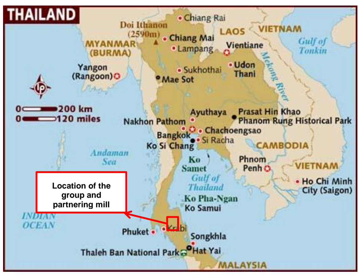
Figure 1-1 Geographical Map of the group in Surat Thani