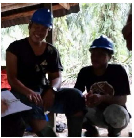
The NCR has been Compliance.

Based on visits and interviews with spray and harvest workers on blocks 28 & 29 West Plasma, it is known that workers have used PPE such as for harvesters (Helmets and Boots) and Sprayers (Gloves, apron, Glasses, Masks, shoes).