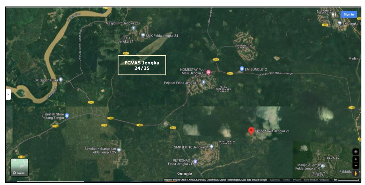
Map 1: Location of Mill and Estate