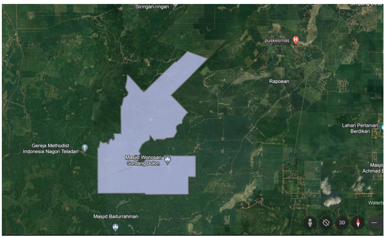
Location of Kebun Padang Matinggi