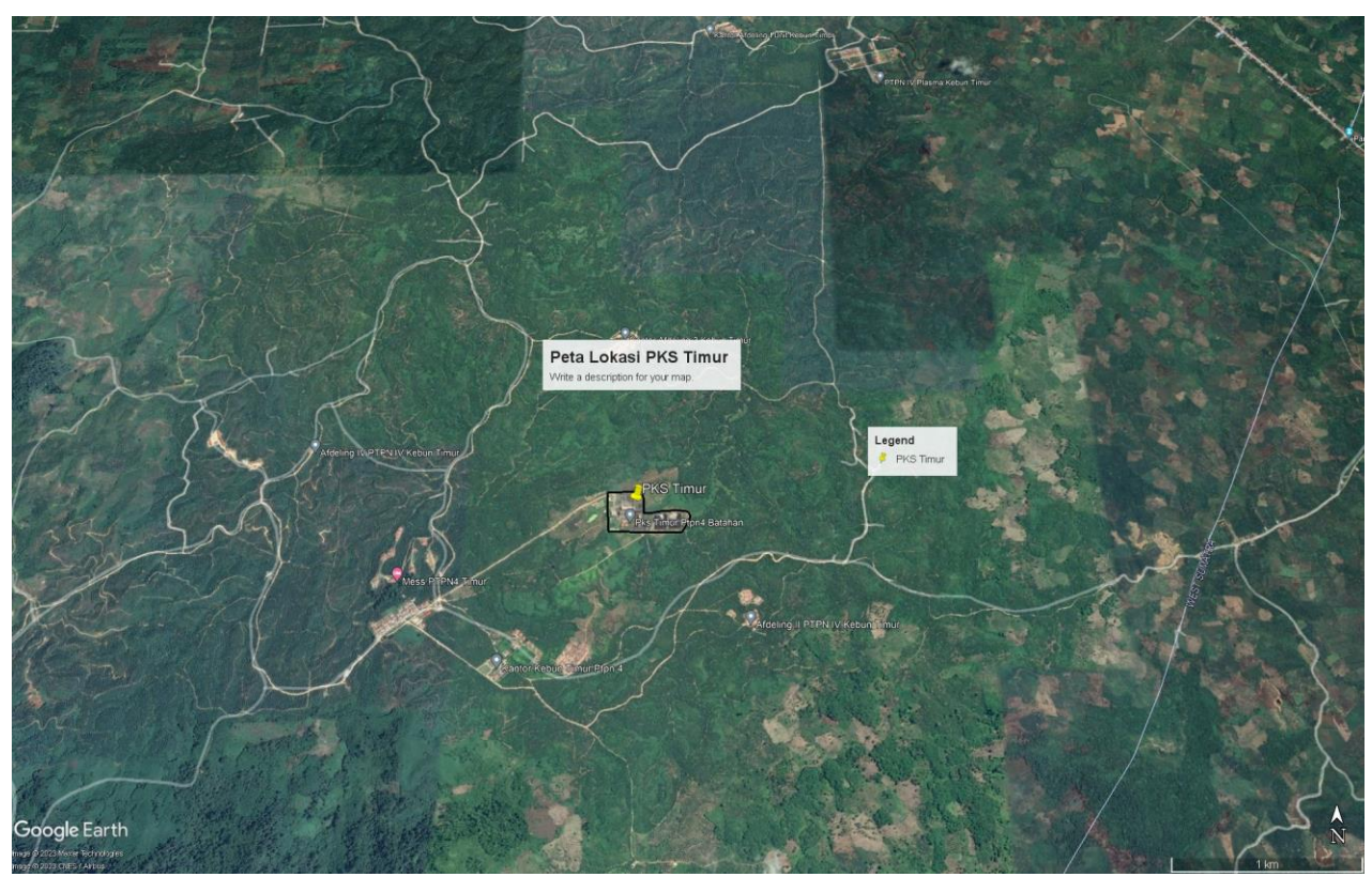
Map of PKS Timur Location