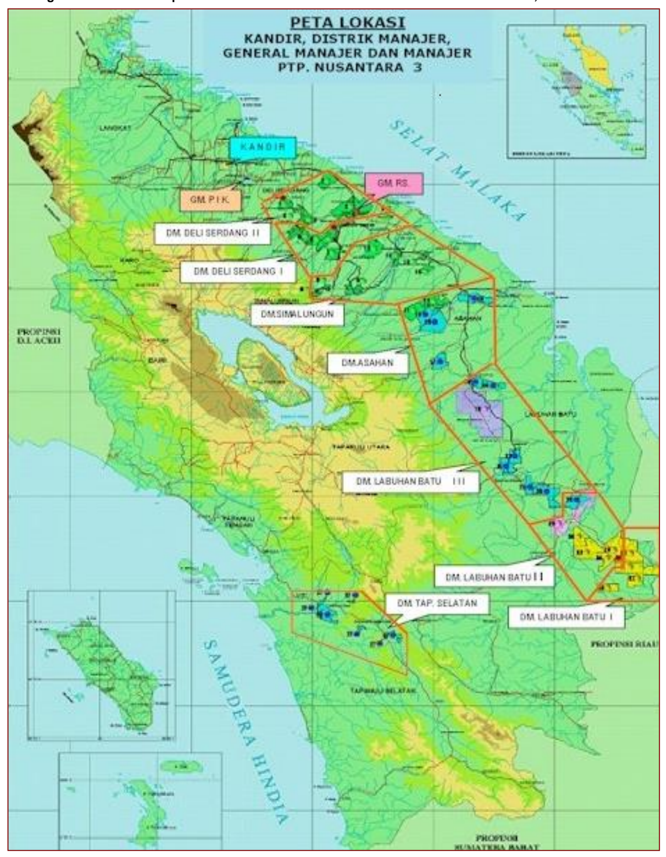
Figure 1a: Location map of PT Perkebunan Nusantara III in North Sumatera Province, Indonesia