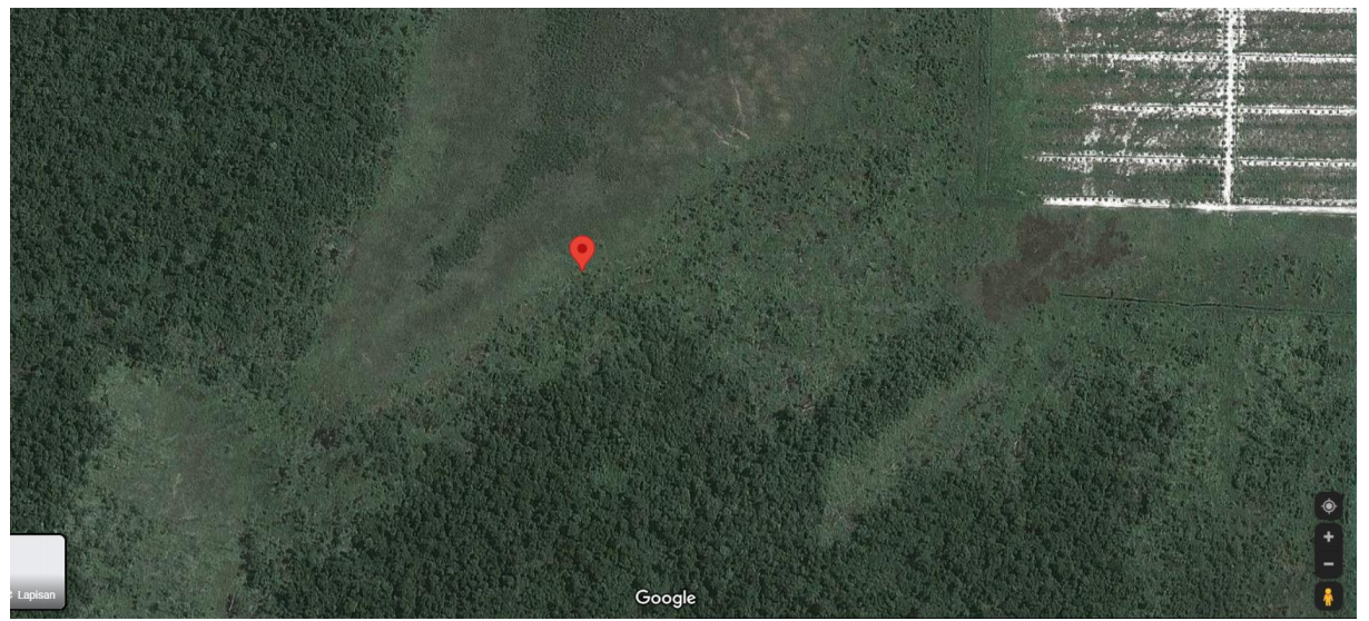
Figure 3: Geographical information 1°35'46.49" S ; 110°19'21.31" E

Result of Satellite Imagery to ensure there is no activity in NPP proposed area in PT Damai Agro Sejahtera.