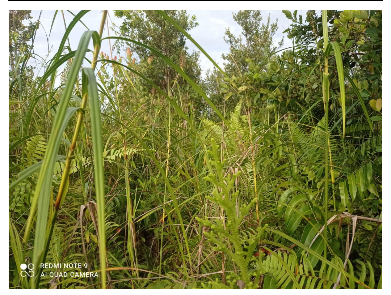
Figure 4. Onsite condition in proposed area for new planting. Geographical information 1^o35'46.49^{\rm w}~{\rm S} ; 110^o19'21.31^{\rm w}~{\rm E}