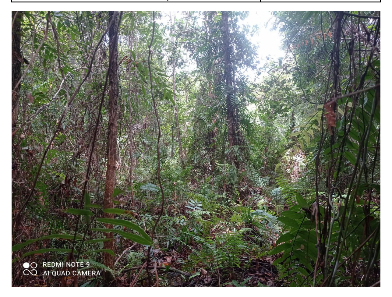
Figure 5. Onsite condition in proposed area for new planting. Geographical information 01^{\circ}36'21.00^{\circ} S ; 110^{\circ}19'33^{\circ}