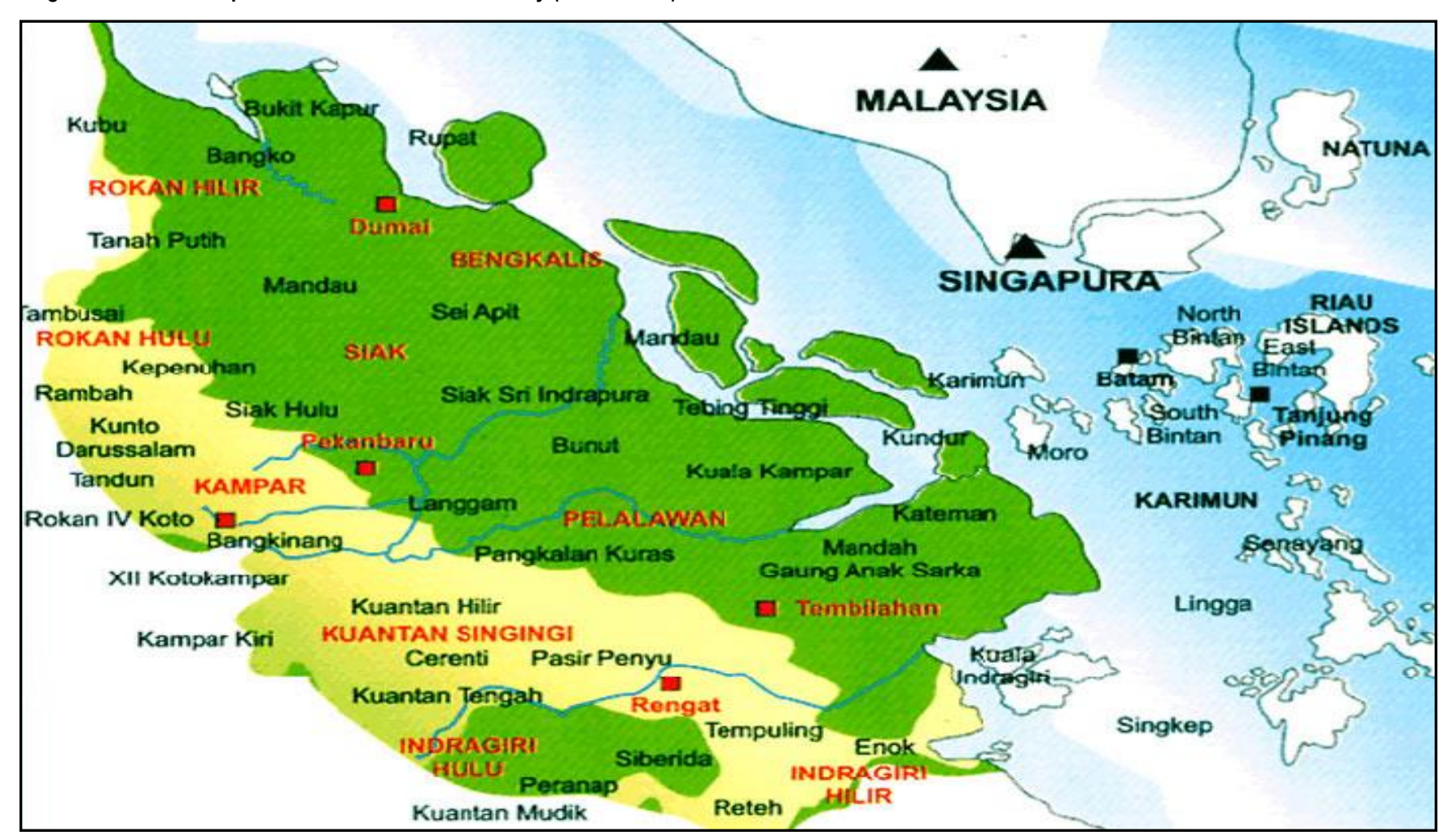
Figure 1. Location Map of PT Adei Plantation & Industry (Mandau Mill)