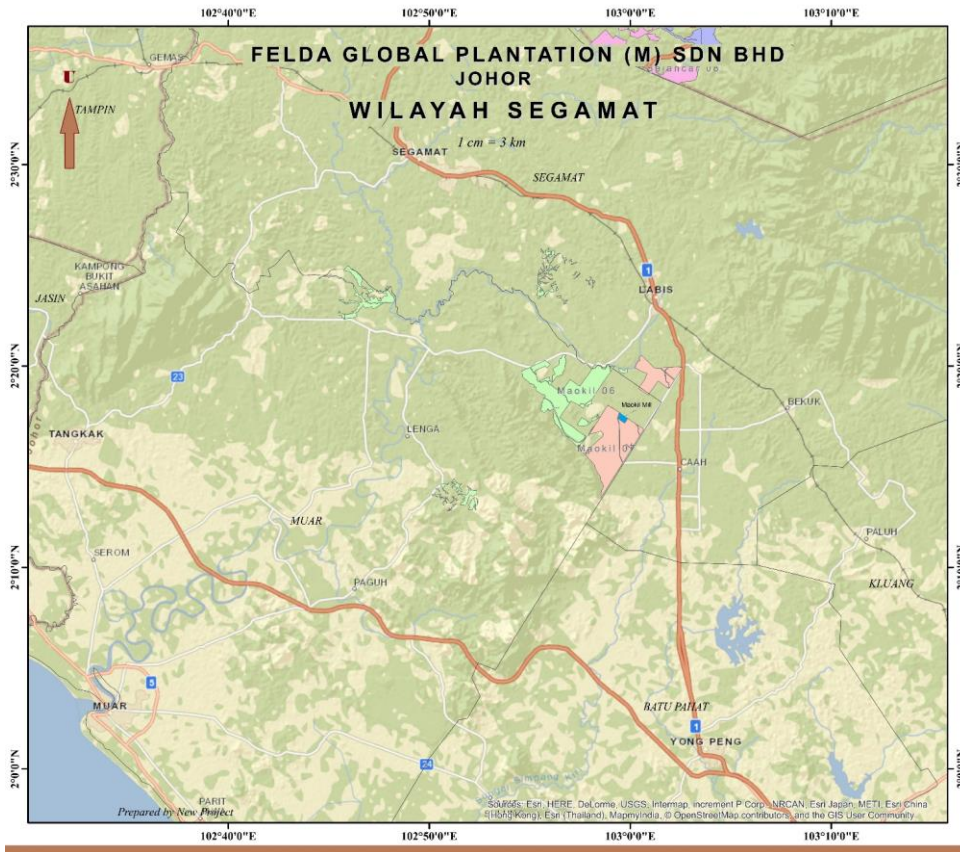
Figure 1. Location Map of Maokil Complex