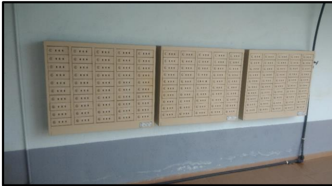
Safety box for passports foreign workers