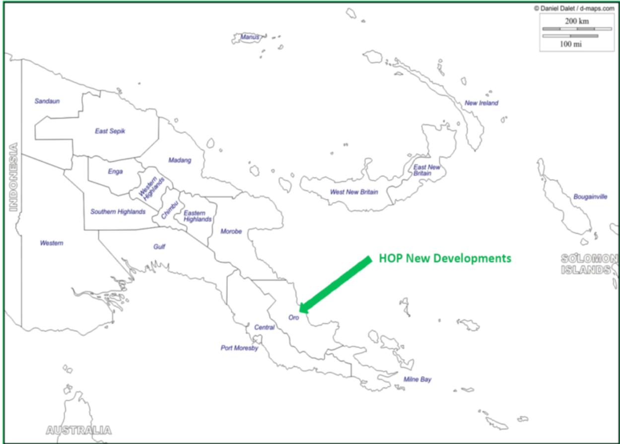
Map 2 Location of proposed new plantings HOP in relation to PNG.