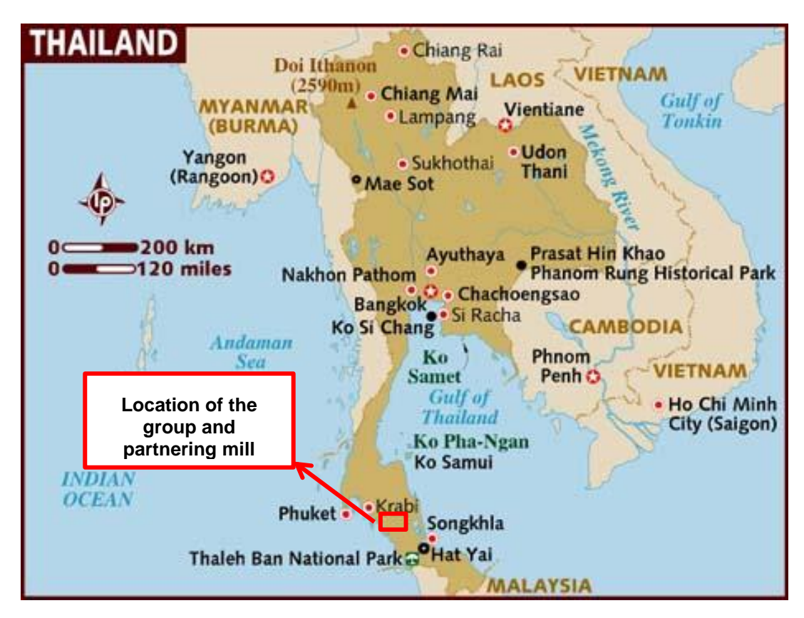
Figure 1-1: Location of the group in Trang province, Thailand