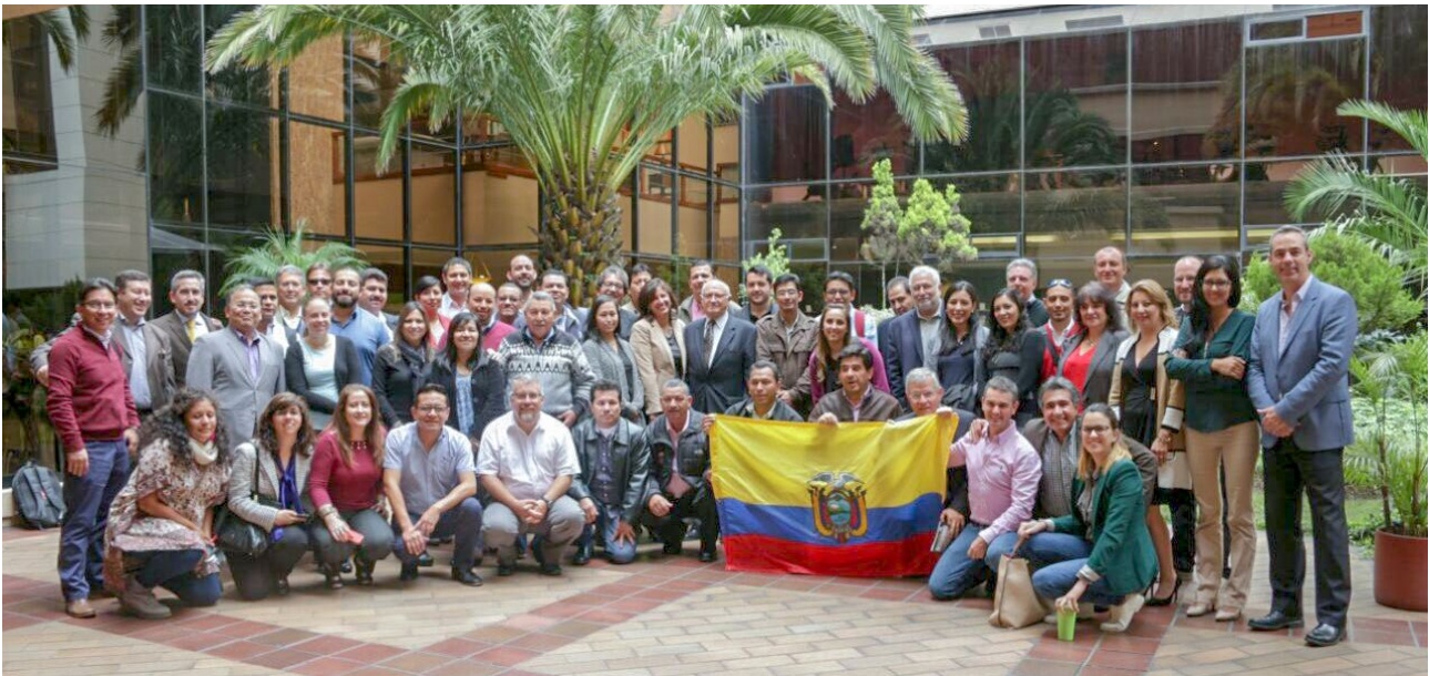
In March 2017, the Ecuadorian national government and RSPO signed a memorandum of understanding (MoU) committing to the process of RSPO Jurisdictional Certification, placing them as pioneers in Latin America.

the first in Latin America. This decision has the potential to inspire other countries to follow, and adopt and implement RSPO's P&C at the national level, ensuring the inclusion of all stakeholders in the production chain from smallholders to large producers to achieve the goal of sustainable palm oil production.